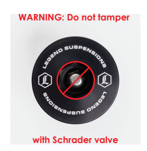
INSTALL INSTRUCTIONS-RH FORK